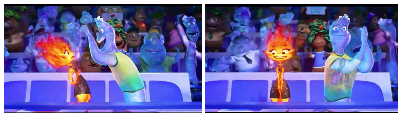
Scene at 00:29:48