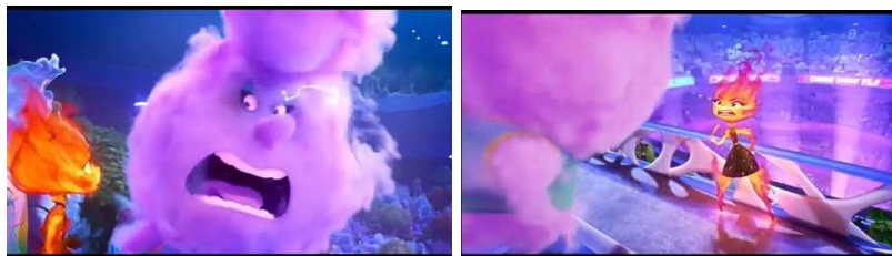
Scene at 00:27:46 – 00:28:02 Gale feels disturbed by Ember's presence.

Datum thirty two depicts Ember trying to settle the matter to cancel the fine at the Fireplace store. She met Gale at a water soccer match. She is accompanied by Wade, who is Gale's coworker. Ember makes her plea for the store's fine to be canceled. However, Gale responded indifferently. This made Ember unhappy with her treatment.