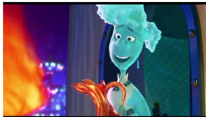
Scene at 00:58:19-00:58:30 After Ember fixed the drink holder, Mrs. Ripple praised her talent.

Mrs. Ripple : And I mean what I said about your talent. I have a friend who runs the best glassmaking firm in the world. During dinner, I slipped out and I made a call and I told her about you.