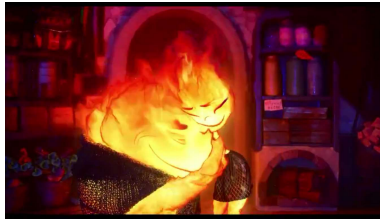
Scene at 00:14:06