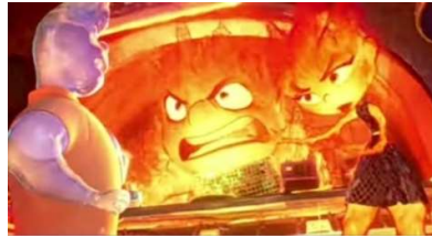
Scene at 00:46:34-00:46:43

[Ember's father] : Water us down? Where's camera? We will never [Ember] : be watered down by you. Get out! Alright, sir, you gotta go. Dad, don't worry. I've got this.