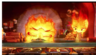
Scene at 00:07:03

Deftly, Ember helps her father make kol-nut.